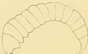
Fig. 2. Aphidius rose Hal. (?). First Stage Larva.

THIRD STAGE LARVA: Very similar to same stage of Praon, except that it is slightly larger and head is more pointed. Length nearly 2 mm.